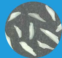
Macrostructure of individual Extra Sharp exploded CERPASS DGE™ - 0123 grains.